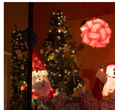
Image and video generation is harder to spot. Often, however, you must look at the small details of an image or a video. What should be straight lines is often warped and bent in nonsensical ways, text is often garbled, and people will usually have too many or too few fingers or limbs. AI generated images are also typically too "clean" in a way that only your subconscious understands.

The question is then, how can we protect against these three main types of AI generation? Text is easy to spot - AI text is always confident about its response, even when it is completely and utterly wrong. AI text also loves to overuse the "em dash" which is a dash character that takes up the entire space between letters—like this.